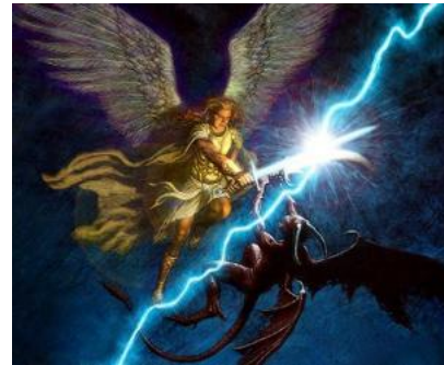
Even Demons Had Free Wills

1) Free will - our choices. Here's where the rubber meets the road each and every day.