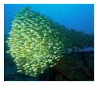
School of Fish - A Plural Unity

1) Elohim. The first name given for God in scripture is elohim . As it happens elohim is the plural form of the word for God. It is used over 4000 times in the Bible and it rarely ever occurs in plural form anywhere else. It is a description of God unique to scripture. Accordingly, a more accurate translation of the first verse of the Bible would be "in the beginning Gods created."