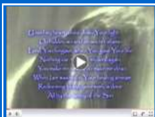
Mercy of the Son with stream

Accusation is a counterfeit of the true knowledge of God. It is a wrong use of genuine discernment. The Holy Spirit may indeed allow us to see sin in another person (or in our self). But a spirit of accusation will seek to bind the person to their sin and separate us from them.