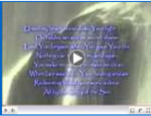
Mercy of the Son with stream

Let us therefore come boldly to the throne of grace, that we may obtain mercy and find grace to help in time of need (Hebrews 4:16 NKJV).